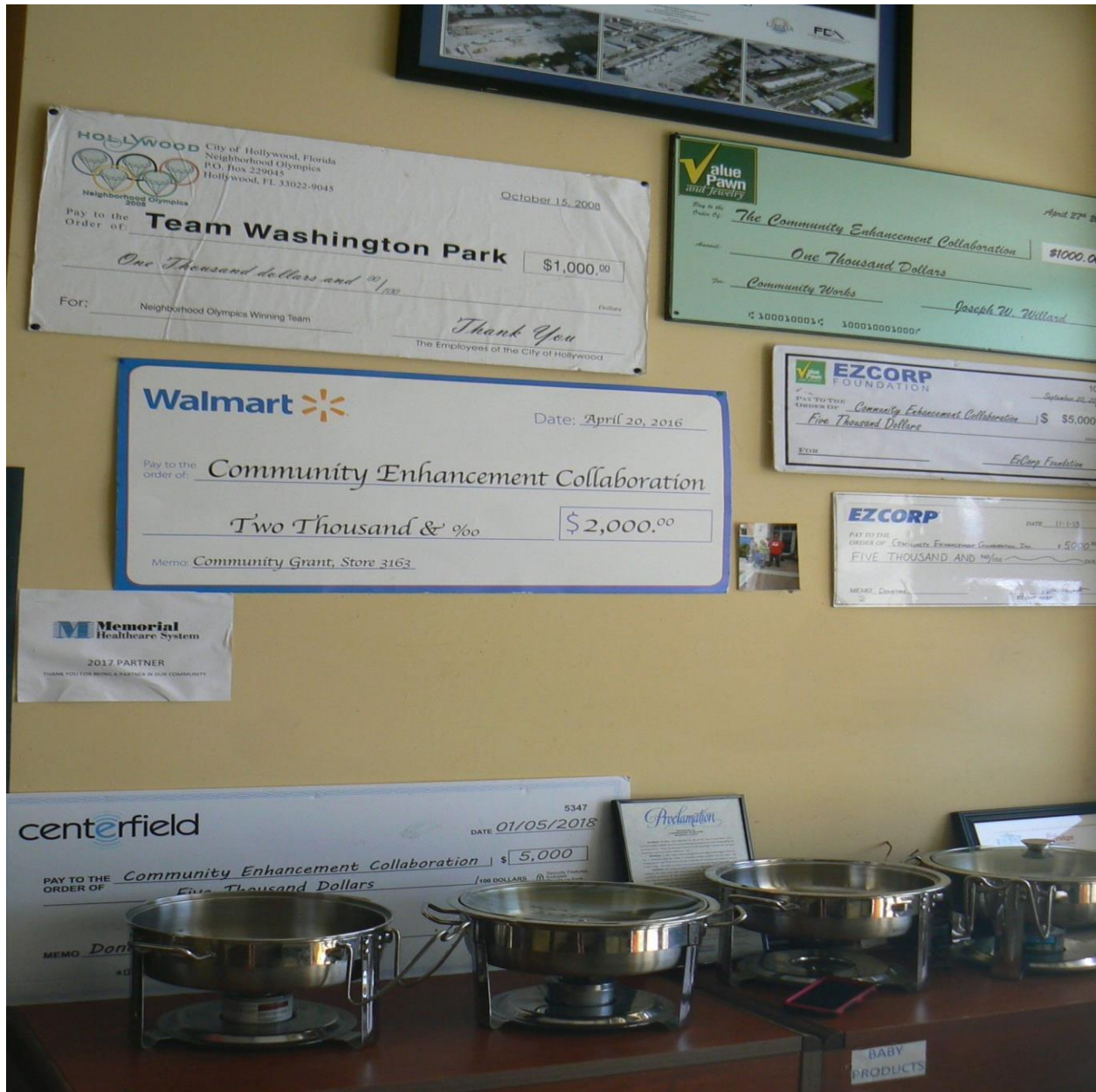
The CEC Wall of Fame/Serving Area.