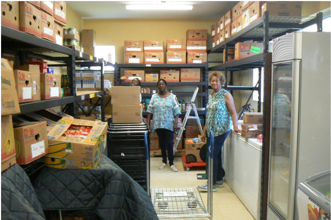
Volunteers stocking the shelves at the CEC Food Pantry.